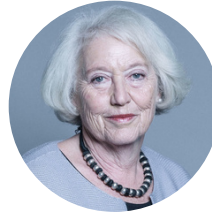
Baroness Hayman Co-Chair